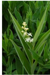
Starry False Solomon's Seal