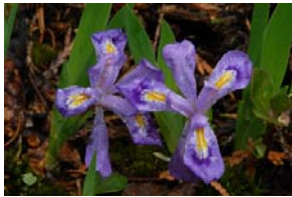
Dwarf Lake Iris