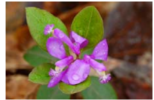
Fairy Wings or Fringed Polygala