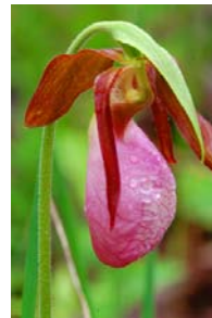
Pink Lady's Slipper or Moccasin Flower