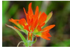
Indian Paint Brush